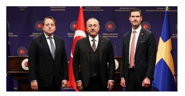
European Commissioner for Neighbourhood and Enlargement Olivér Várhelyi and the